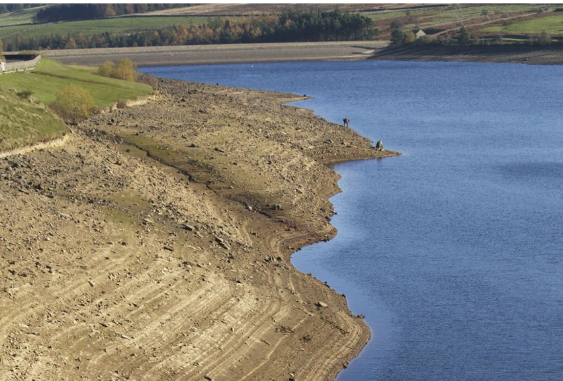
Climate Adaptation Solutions