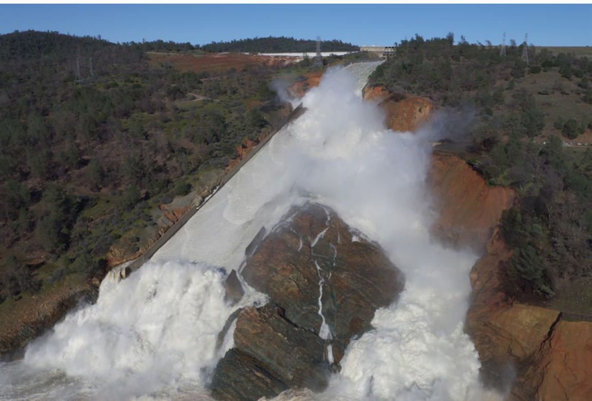
Risk Informed Decision Making