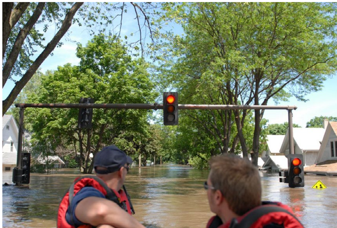
Consequences Modeling and Flood Damage Assessment