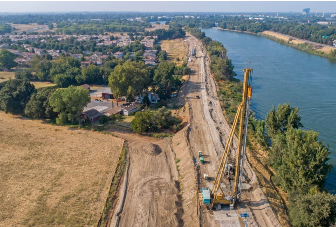
Levees and Flood Defences Engineering, Design and Construction