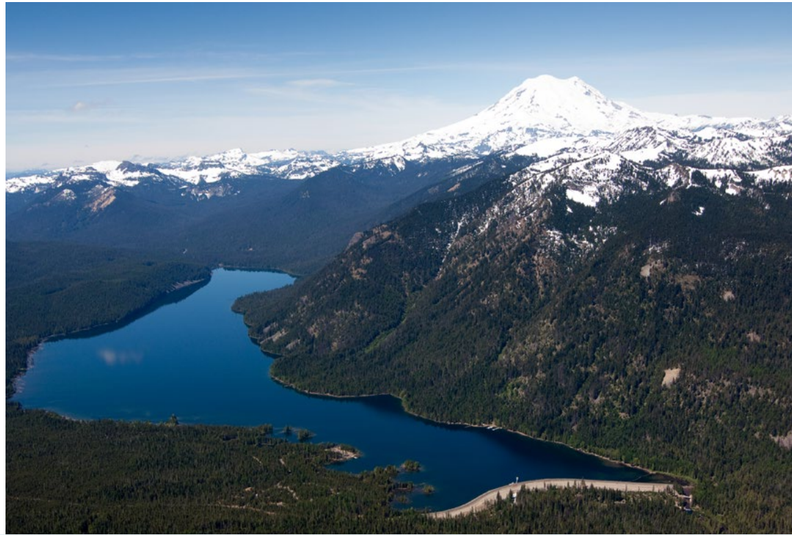
Integrated Water Management