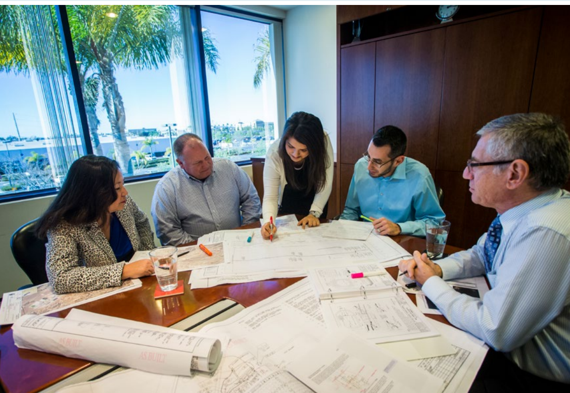
Policy and Program Consultancy